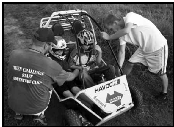
Prepping the driver.