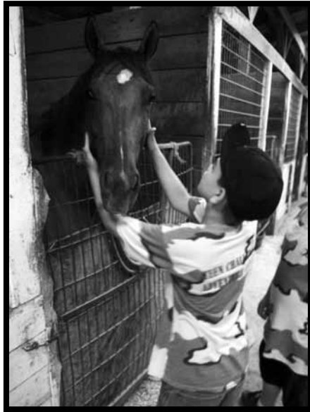
At the stables for a ride.

This year's Adventure Camp for boys 8 to 12 years old was another huge success! This year's leadership theme was "Dream Big" from Jeremiah 29:11.