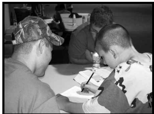
Seeking out leadership in God's Word.