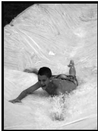
The awesome 235' slide of an adventure!