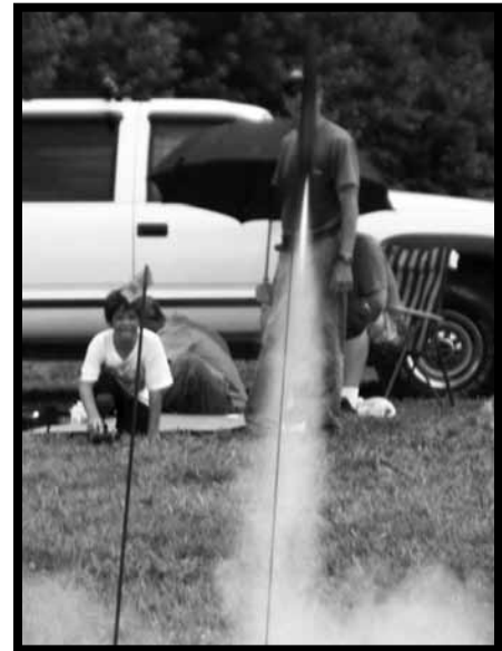
3-2-1 Blast off!