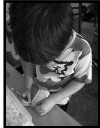
Building my rocket.